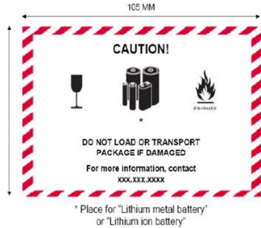
Figure 13: Shipping Labels for Smaller Packages for Batteries

The Class 9 label must be available for the proper limit battery weight per package (see Figure 14). This should be present on the pallets and master carton.